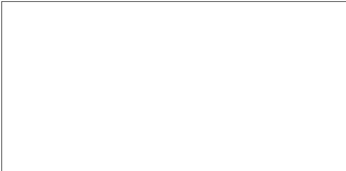
Figure 1. Sites where the Yellow Rail has been found in Canada during the breeding season and where it could still occur.

Canada comprises an estimated 90% of its breeding range (Alvo and Robert 1998). The two main breeding locations are in the prairies and in the Hudson/James Bay region. The known Canadian distribution includes the Mackenzie District of the Northwest Territories, British Columbia, eastern Alberta, central Saskatchewan, most of Manitoba and Ontario, the southern half of Quebec, New Brunswick, and northern Nova Scotia (Godfrey 1986).