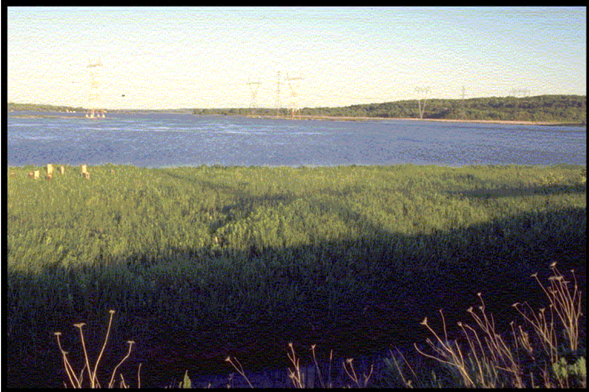
Figure 2. Matchedash Bay

Matchedash Bay IBA, 18 square kilometres in area, is located in Severn Township (population 10,257), Simcoe County, near the southeastern end of Georgian Bay (Figure 1). The marshes of Matchedash Bay are the largest and most diverse along the Georgian Bay shoreline. The southern half of the IBA contains the extensive marshlands at the confluence of the Coldwater and North Rivers, while the northern half encompasses the marshes and open water of Matchedash Bay. Water from the bay empties into Severn Sound, a large sheltered passage of open water separated from Georgian Bay by Beausoleil Island. The villages of Coldwater, Waubaushene and the hamlets of Fesserton and Lovering, lie just outside the boundaries of this IBA.